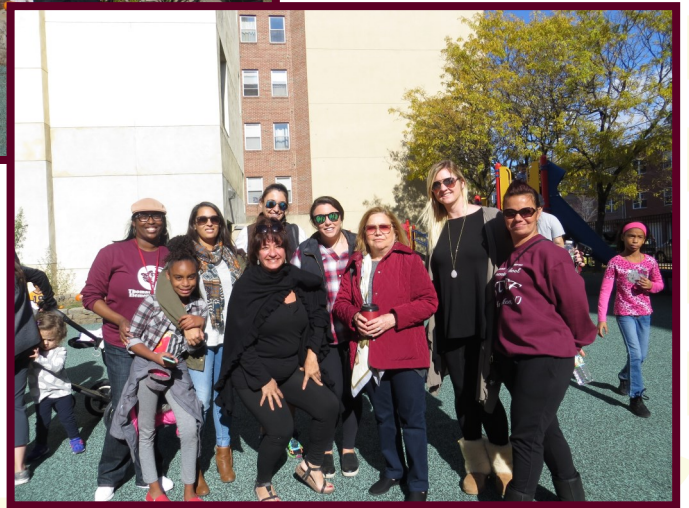
Staff members came out to support the great event put together by our PTO!